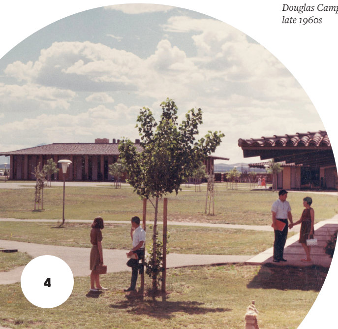
Douglas Campus, circa late 1960s

On Aug. 21, 1962, county residents came together again to vote on and pass a $1.6 million bond issue to build Cochise College. Construction of the Douglas Campus began on Sept. 23, 1963. A groundbreaking ceremony that day marked the momentous occasion.