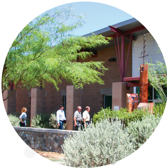
Above: Exterior of the Benson Center in 2000.

A groundbreaking ceremony for the new center was held Jan. 14, 2000, and an opening ceremony was held Aug. 15, 2000. The center opened for classes Aug. 21, 2000.