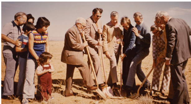
Above: Groundbreaking ceremony for the Sierra Vista Campus in 1977. Top right: Willcox Center circa 2000s. Bottom right: The portable Buena Center being moved to the Sierra Vista Campus, circa 1977.