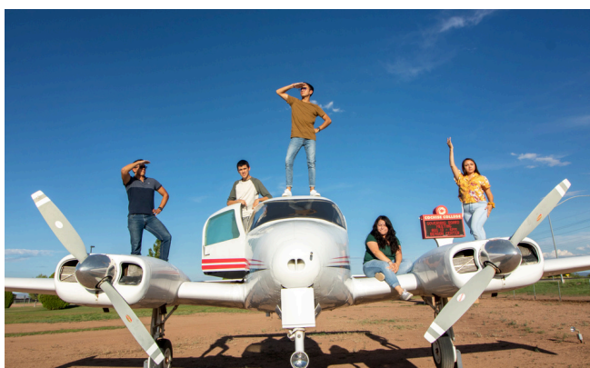
2018-2019 RESIDENT ASSISTANTS

It is each student’s responsibility to read, understand and follow all of the information, policies and procedures outlined in this Handbook. Failure to read this Handbook does not excuse any violation of policies or procedures. Policies and procedures found within this document are subject to review and evaluation, Cochise College reserves the right to make changes at any time with or without notice.